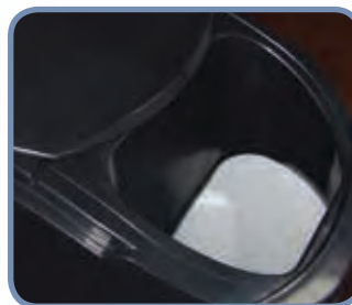
Sliding cover design for easy salt refill