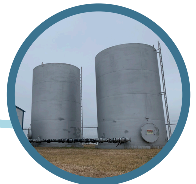
3: Storage Tank