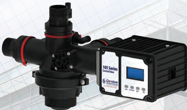
105STS Single Valve Series