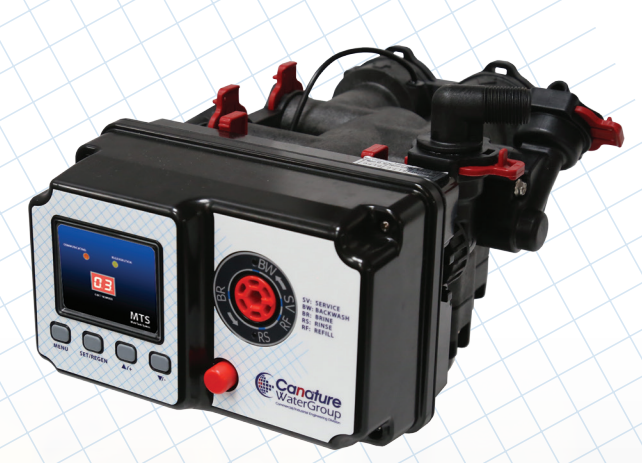
MTS 95 Series Valve