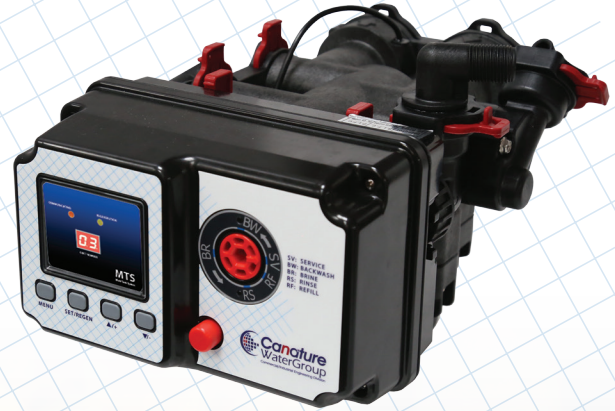
MTS 95 Series Valve